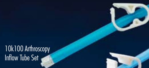
10k100 Arthroscopy Inflow Tube Set