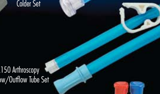
10k150 Arthroscopy Inflow/Outflow Tube Set