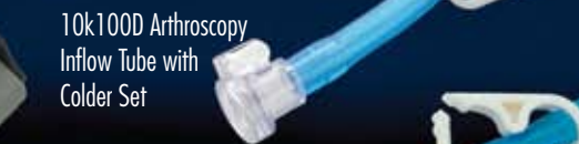
10k100D Arthroscopy Inflow Tube with Colder Set