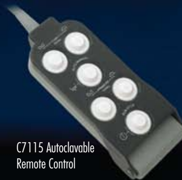
C7115 Autoclavable Remote Control